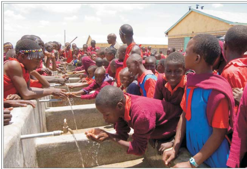
Children at Aitong primary School enjoying clean water