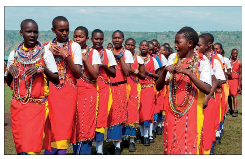
Mara Rianda Primary School pupils dancing

As usual I do apologise if you feel this letter is an intrusion and should you not wish to receive any further letters then please do let me know.