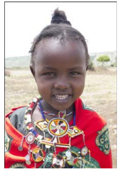
We are looking to provide further bursaries for pupils to attend secondary school from January 2013. Last year we were able to provide 10 bursaries and we hope to provide at least 12 next year.

If you are a UK tax payer a bursary can be funded by monthly standing order of £26 for three years. With Gift Aid your donations will effectively be the full amount required to fund one child for four years of education. If you are interested in assisting a child in this way please let me know and return the attached standing order and Gift Aid form.