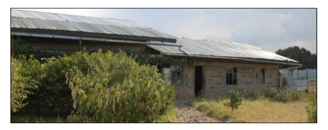
The original classroom block at Mara Rianda Primary School 2003, at that time the school had about 250 pupils.