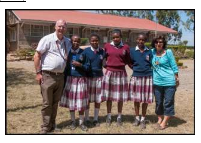
Our first girls at Maasai Girls Secondary School - 2012