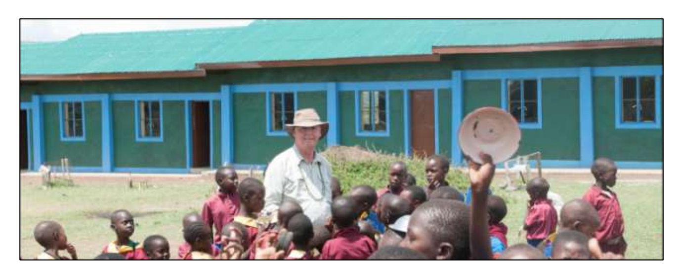
The new classroom block in 2008. The school now has over 1,000 pupils.