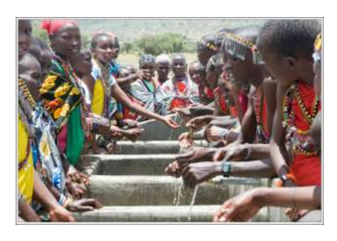
Pupils at Aitong Primary School after the charity provided a clean source of drinking water -2009