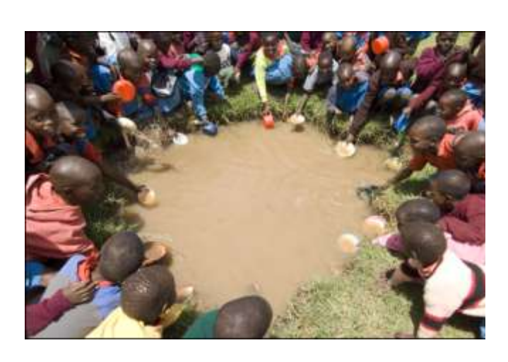
Pupils at Aitong Primary School collecting drinking water from their then only source - 2005