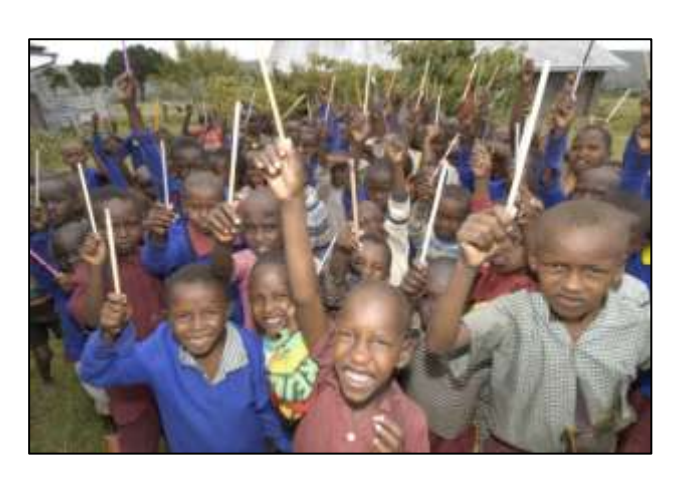
Excited pupils with their very first own pencils - 2003