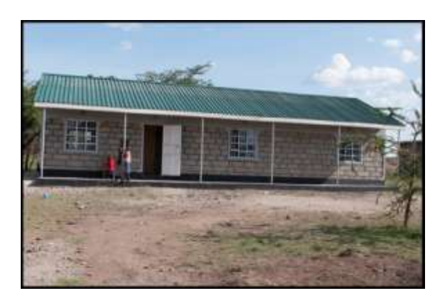
The new maternity unit with equipment funded by the charity - 2012