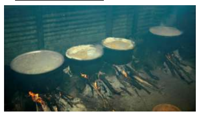
Inside the old kitchen at Mara Rianda Primary School - 2010