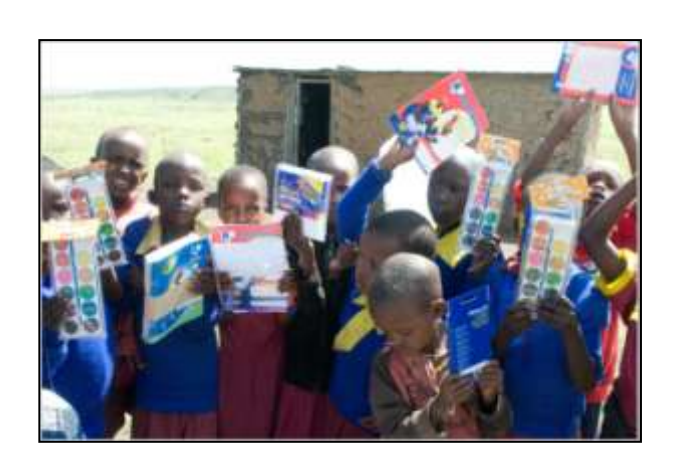
Preschool children with books and equipment - 2010