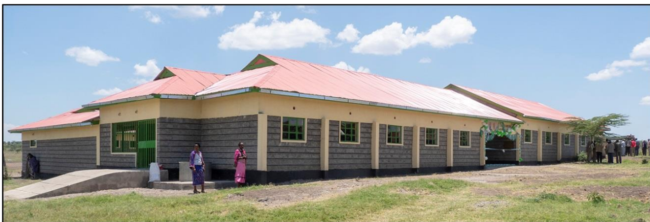
The new dormitory with toilets and showers for 160 girls