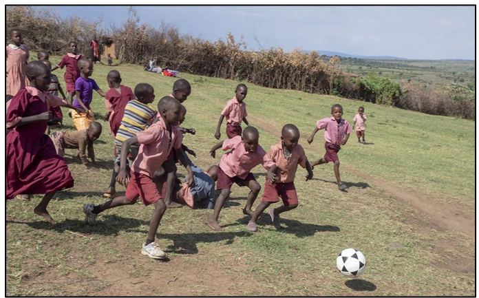
Playing Football at Olpurkel School

With Gift Aid your donations will effectively be the full amount required to fund one child for four years of education. If you are interested in assisting a child in this way please let me know and I shall send you a standing order and Gift Aid form.