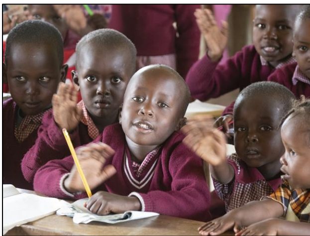
Pupils at Enkereri School