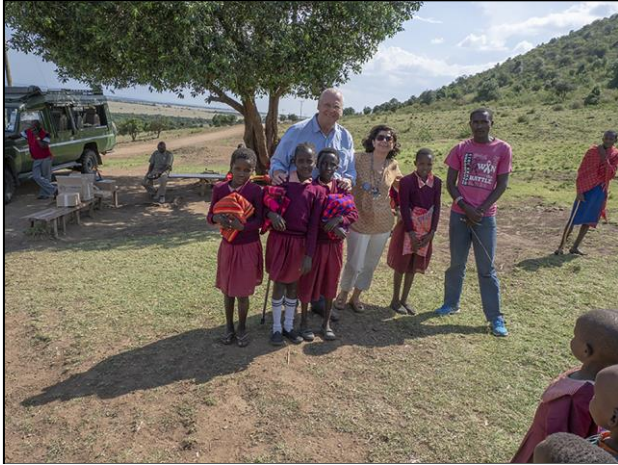
Delivery to Olpurkel School

Support is always welcome and greatly appreciated. There is always a need for new books, sports equipment and general school supplies as well as assistance with capital projects. Should you wish to give any support please make cheques payable to The Mara Rianda Charitable Trust. As usual I do apologise if you feel this letter is an intrusion and should you not wish to receive any further letters then please do let me know.