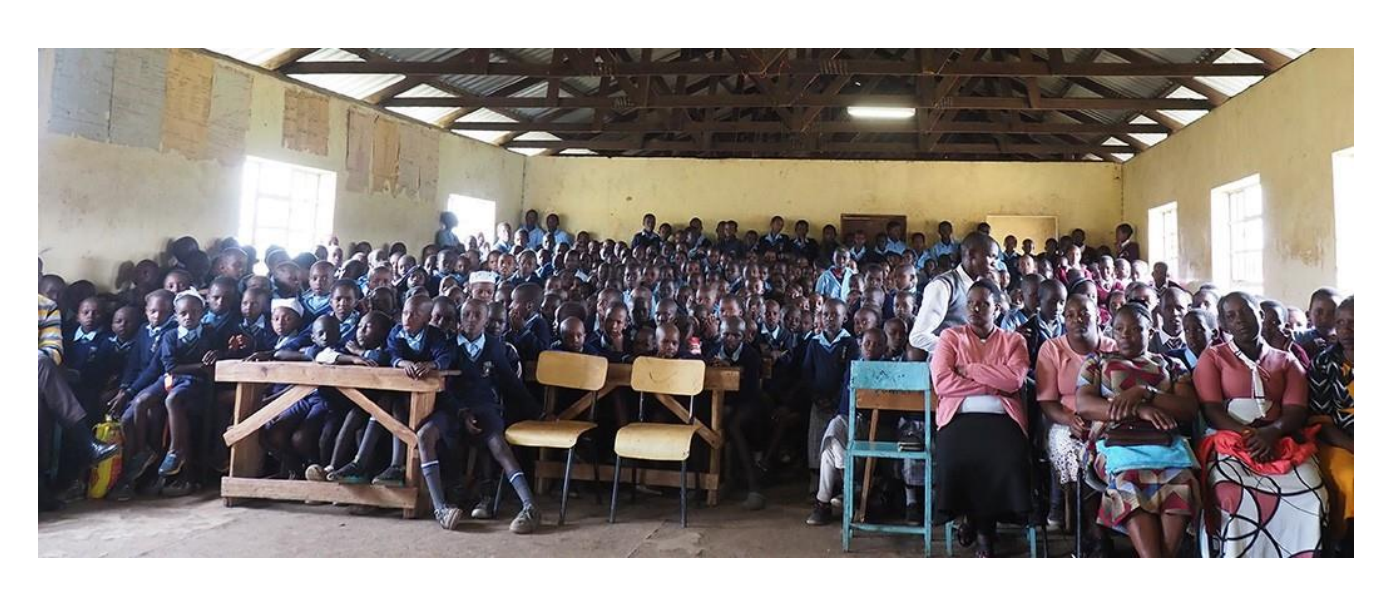
Surprise party 14 March 2023 at Mara Rianda